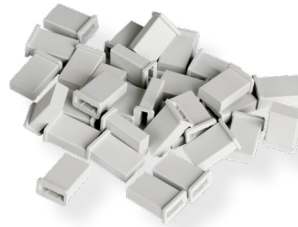
Busbar end caps NOT to be used in conjunction ADRBTPN